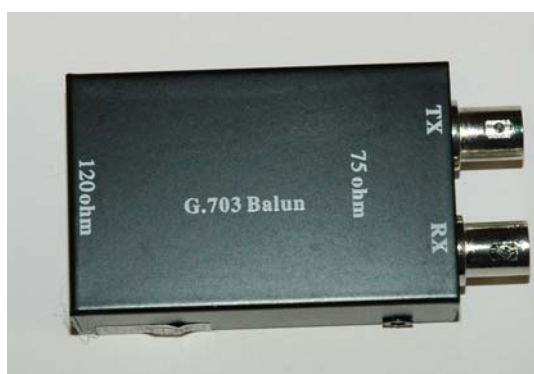
Figure 1-3 75 Ohm E1 Balun

Each 75 Ohm trunk is normally connected via a pair of coaxial cables with BNC connectors. A Balun is available to convert between RJ45 and co-axial cabling. The Balun also converts between 120 and 75 Ohm interfaces, so the system does not need to be configured for 75 Ohm operation when this type of converter is used.