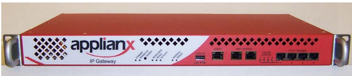
Figure 1-1 1U chassis front layout (4 trunk shown)

# Subject to variation between different system capacities